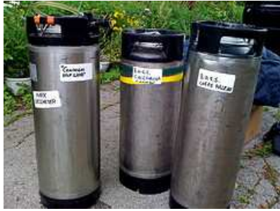
BOSS Club Night