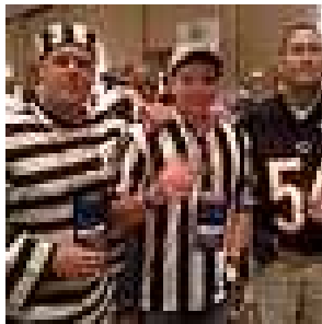
Dirty Chicago Politicians